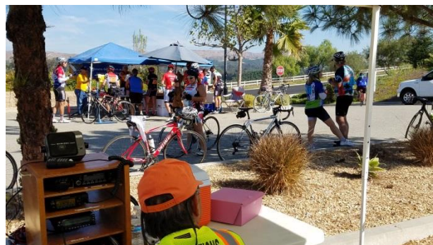
KI6OQ OP at AID-3 for Share the Road Bike Ride