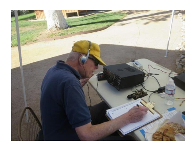
7 Log it!