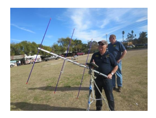
6 Tracking a pass of AO-85