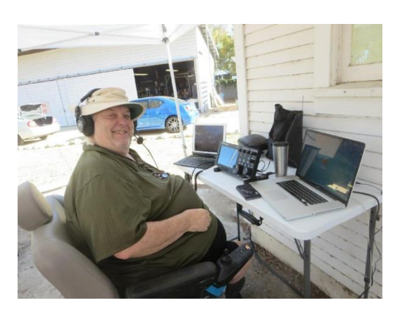
Mikes W6S remote setup at Rocket Day