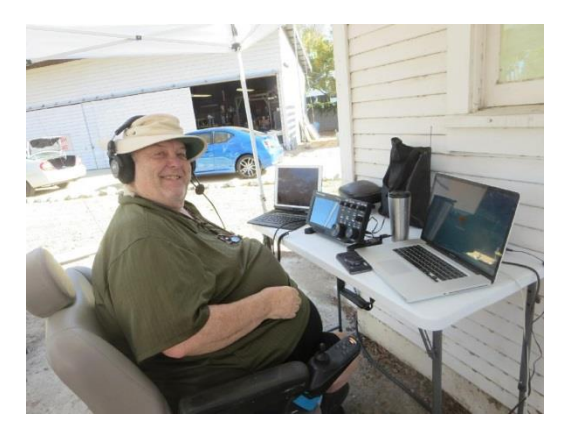
Mikes W6S remote setup at Rocket Day