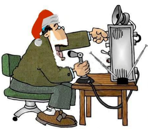
www.shutterstock.com · 23911