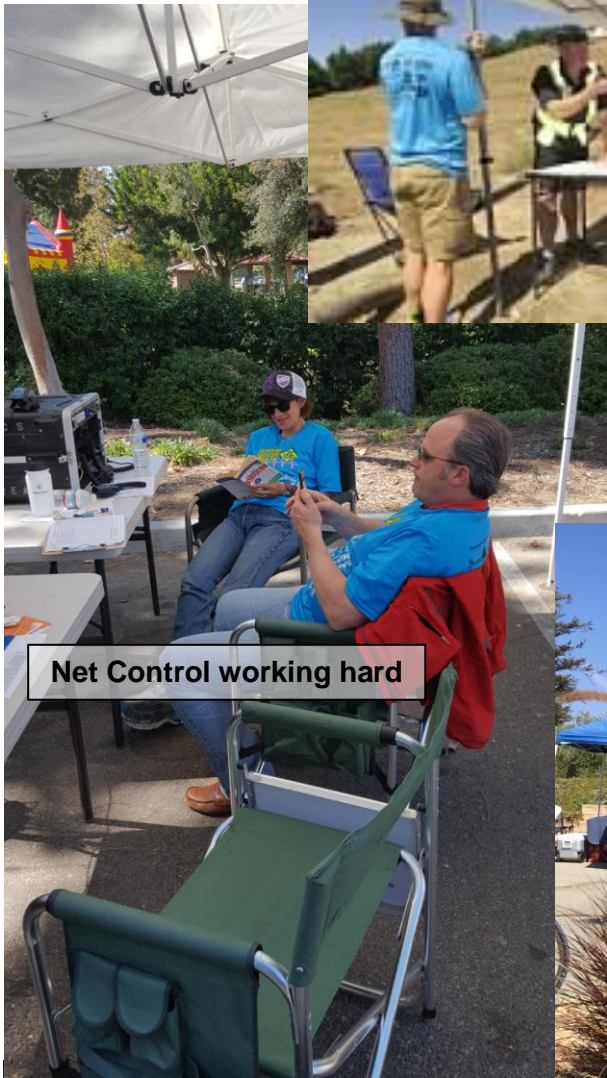
Net Control working hard