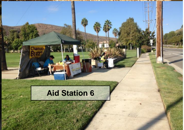
Aid Station 6