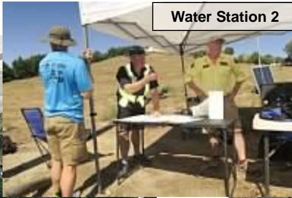
Water Station 2