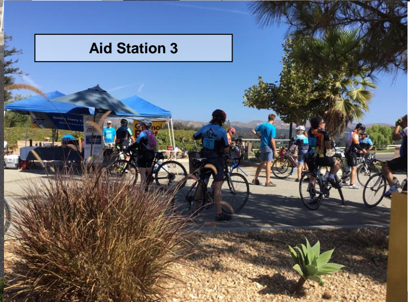
Aid Station 3