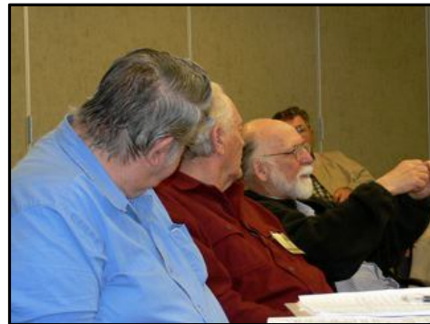
Simi Settlers' Discussion during March 2009 Meeting