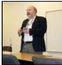
The Prez Sez...

Everyone is welcome. Hope to see you there. Where? Simi Senior Center 3900 Avenida Simi, Simi Valley CA