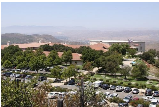
Hillside View of Reagan Library and Field Day Activities